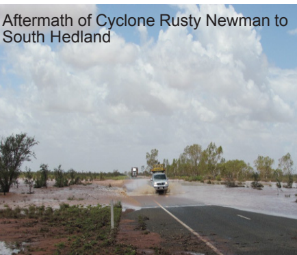
Aftermath of Cyclone Rusty Newman to South Hedland

BSWA visits nearly 100 towns in a two year cycle, some towns are visited annually, using three trailers and one truck.