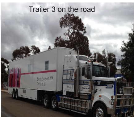
Trailer 3 on the road