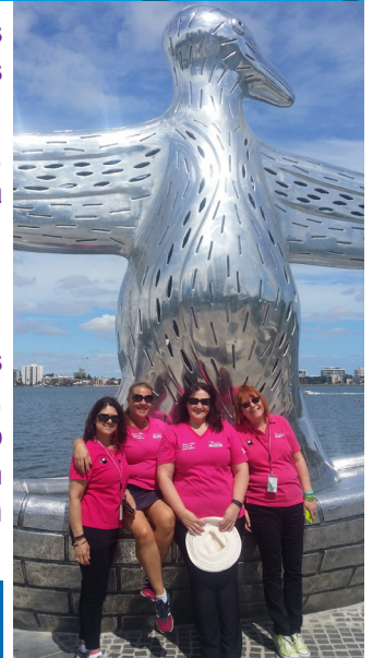
One of our walks to Elizabeth Quay in 2016