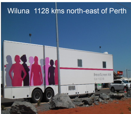
Wiluna 1128 kms north-east of Perth